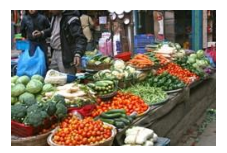
Day 5: Thimphu Sightseeing Morning visits the lively and colourful Farmers Market (Friday, Saturday, Sunday) where the locals from the surrounding villages come to sell their produce. Visit the traditional Hand Made Paper Mill. Visit the School of Arts and Crafts, where students learn 13 different arts and crafts used predominantly in Bhutan. Visit Folk Heritage Museum, which houses Traditional Bhutanese house with lifestyle.

Day 4 Haa – Thimpu Today you will continue your drive to Thimpu. After lunch visit the Memorial Chorten (temple) built in memory of the late 3rd King. This place now teems with elderly devotees chanting prayers. Visit Changangkha Lhakhang, the oldest temple in the valley offering a beautiful view of the valley. Continue to Takin enclosure, where Bhutan's national animals are kept. Continue your drive to visit one of the world's largest sitting Buddha Statue, offering bird eye view of the Thimphu city. Visit the Tashichho Dzong, the fortress, which houses the throne of the king (open after 5pm and on weekends). Evening stroll at leisure vibrant Thimphu Street, which sells anything from red rice, sundried chilli peppers, handcrafts, souvenirs to modern utilities. Overnight: Thimphu| Altitude: 2300m Overnight Haa (BLD)