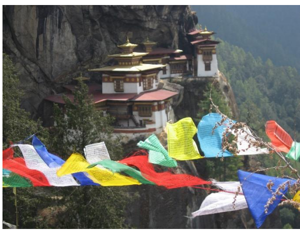
Day 15: | Paro Sightseeing

Today is what you have come to Bhutan to experience, hiking to the Tigers Nest Monastery. It is a short drive to the start of your 3 hrs uphill hike to Tiger's Nest, the most revered temple in the country that literally hangs on a granite cliff overlooking the Paro valley. Most of the day will go on the hike. Farewell dinner with your guide.