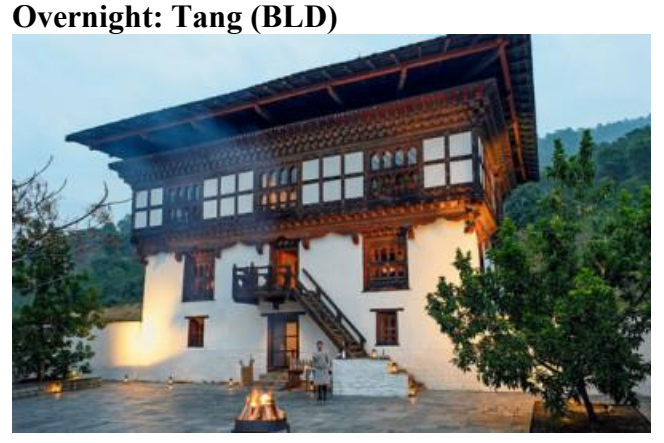
Day 11: Tang to Trongza Depart Tang for your 4-hour drive to Trongza

Morning after breakfast drive to the remote isolated village of Tang, due to its remoteness, very few tourists get to visit this village. The landscape is beautiful crossing through many small villages. Just before reaching Tang village, if you want to avoid driving, you have an option to take a shortcut by crossing the bridge and walk for about half an hour to the O'Chholing palace, the ancestral home to the royal family of Tang region which is converted into a museum. Visit the unique museum of O'Chholing, which has very fine and unique collection of Bhutanese Arts and Artifacts. It covers and explains about all the history and details of Tang village activities during the olden days. Hot lunch in the museum guest house. Enjoy the calmness and the beautiful view of the Tang valley. Walk around the tiny village, meeting the locals, the shy children and interacting with them. Later to drive back to Jakar.