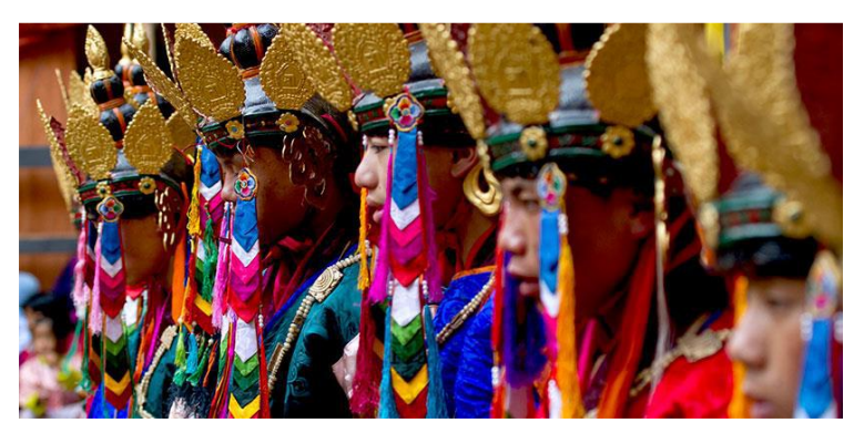
Day 07: Phobjika sightseeing.

Goempa temple, the largest monastery in the country belonging to a different sect of Buddhism to witness the most popular Black Necked crane festival where locals from around the valley come to witness the annual festival. It's a colourful festival dedicated to the Black Necked Cranes which is considered very sacred. Many other cultural and religious dances are also performed to commemorate the event. After lunch continue in the festival until 4-5 PM. This valley is protected being winter home for the endangered Black Necked Cranes migrating to Bhutan every end of Oct to end of Feb. This valley is an outdoor paradise. If you are too tired after the long drive, could relax in the hotel and enjoy the breathtaking view of the valley. Overnight: Phobjikha| Altitude: 2900m (BLD)